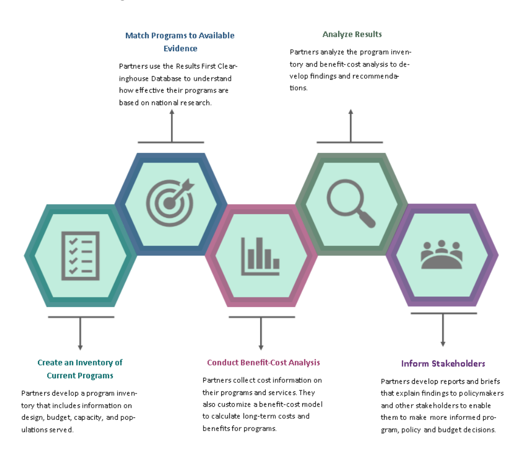
Figure 1: Pew-MacArthur Results First Process

Results First is a joint effort of The Pew Charitable Trusts and the John D. and Catherine T. MacArthur Foundation. Results First works with states to implement a benefit-cost analysis approach that helps policymakers make decisions about investments in policies and programs that are proven to work. At no additional cost to the state, Results First partners receive training and technical assistance, a nationally representative clearinghouse database of evaluated programs, and a benefit-cost model that helps identify evidence-based programs that yield high returns on investment. Figure 1 below provides an outline of the Results First process.